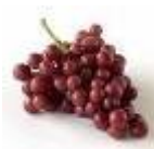
1 kilogram of grapes

Instructions: Your friend is going to the supermarket. Below is a list of TEN (10) things you need, in order to prepare dinner for you and your family. Use the phone to talk to her. Tell him/her in English what you need ( do not use Farsi to do this task ). If he/she does not understand what he/she has to buy, explain in English and use all of the details. You have 10 minutes to complete the task.